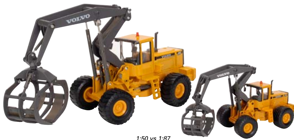
1:50 vs 1:87