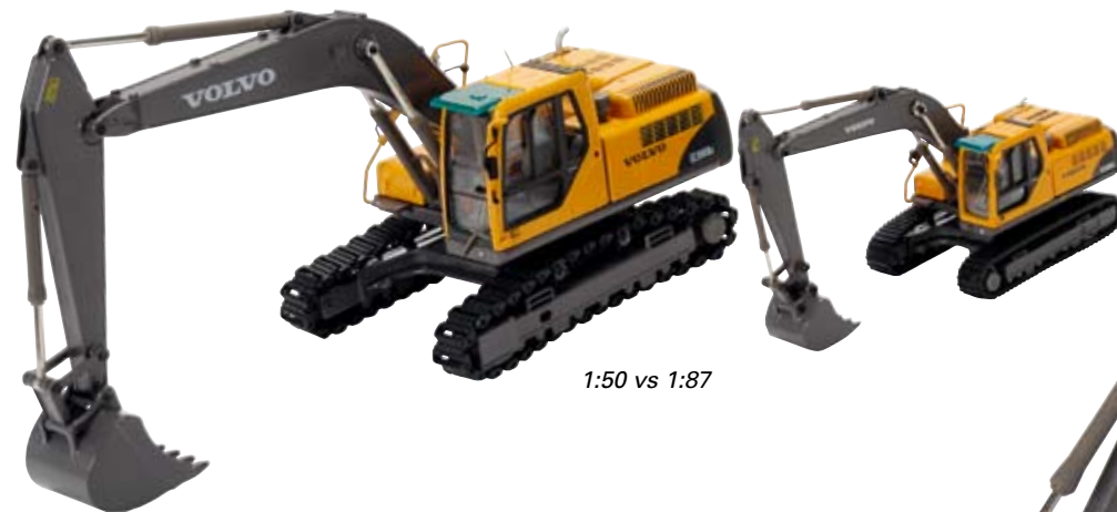
1:50 vs 1:87