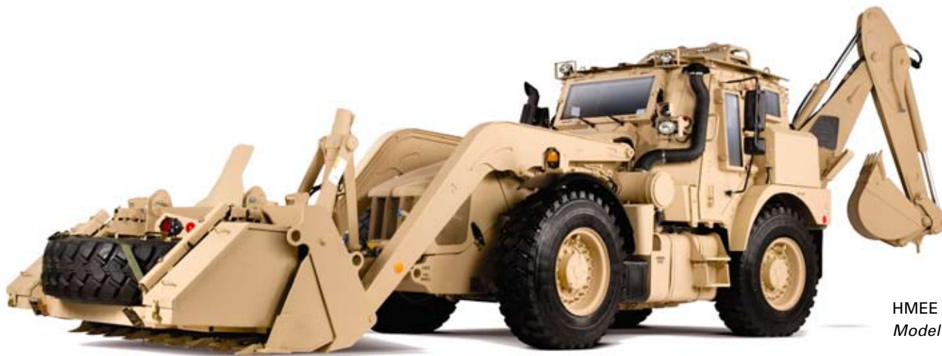
HMEC US version. Model has no armour guard.