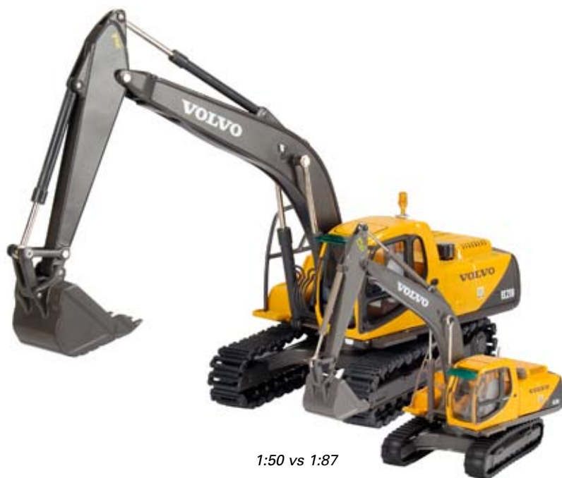
1:50 vs 1:87