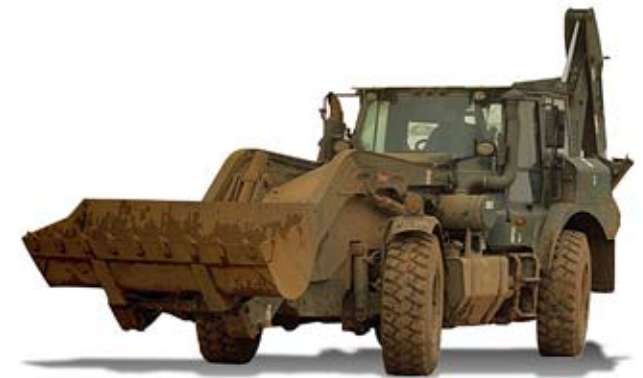
HMEC EU version.

Fully diecast metal model. Highly detailed with authentic functions. Not suitable for children under 3 years.