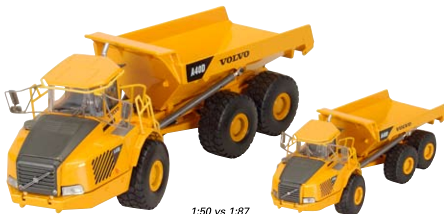
1:50 vs 1:87