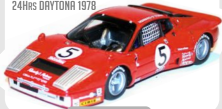
FERRARI 365 GT4 BB #5 - HOWARD O'FLYNN 24 Hrs DAYTONA 1978