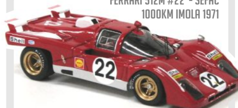
FERRARI 512M #22 - SEFAC 1000KM IMOLA 1971