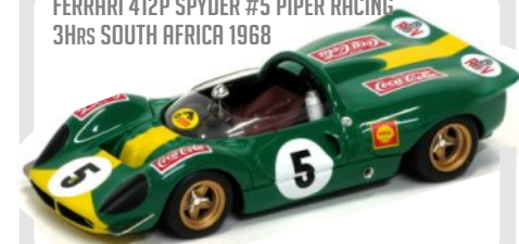
FERRARI 412P SPYDER #5 PIPER RACING 3Hrs SOUTH AFRICA 1968