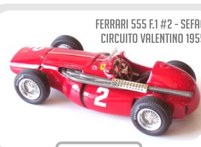
FERRARI 555 F.1 #2 - SEFAC CIRCUITO VALENTINO 1955