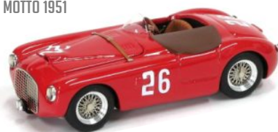
FERRARI 212 #26 MOTTO 1951