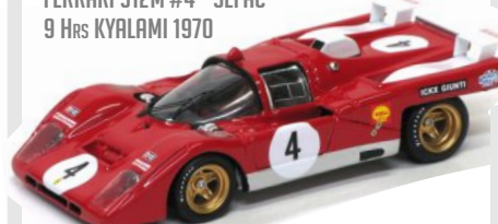
FERRARI 512M #4 - SEFAC 9 Hrs KYALAMI 1970