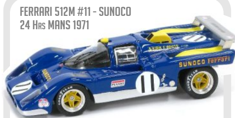
FERRARI 512M #11 - SUNOCO 24 Hrs MANS 1971