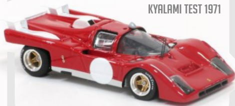
FERRARI 512M KYLAMI TEST 1971