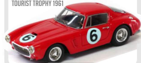
FERRARI 250 SWB #6 TOURIST TROPHY 1961