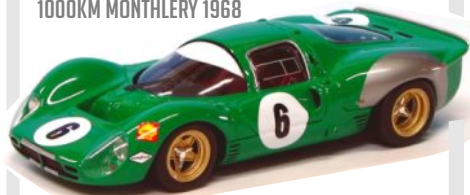
FERRARI 412P #6 - PIPER RACING 1000KM MONTHLERY 1968