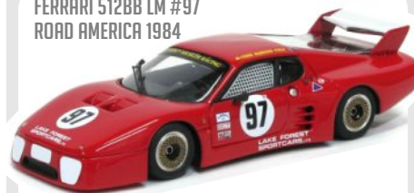
FERRARI 512BB LM #97 ROAD AMERICA 1984