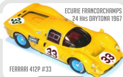
ECURIE FRANCORCHAMPS 24 Hrs DAYTONA 1967