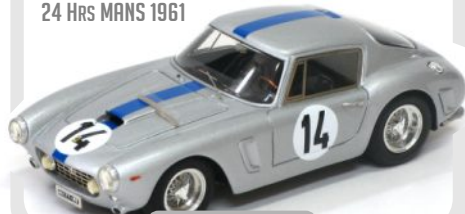
FERRARI 250 SWB #14 - NART 24 Hrs MANS 1961