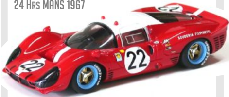
FERRARI 412P #22 - EC.FILIPINETTI 24 Hrs MANS 1967