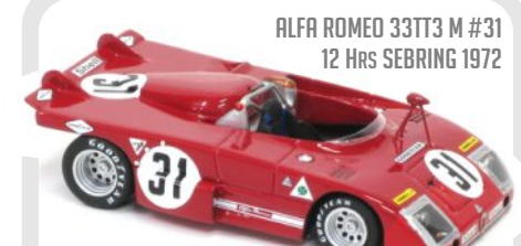
ALFA ROMEO 33TT3 M #31 12 Hrs SEBRING 1972