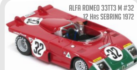
ALFA ROMEO 33TT3 M #32 12 Hrs SEBRING 1972