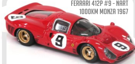
FERRARI 412P #9 - NART 1000KM MONZA 1967