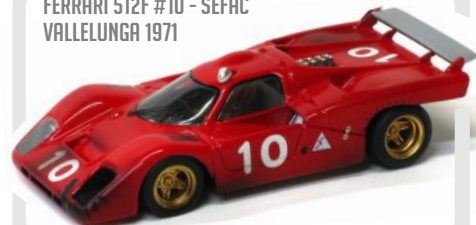
FERRARI 512F #10 - SEFAC VALLELUNGA 1971