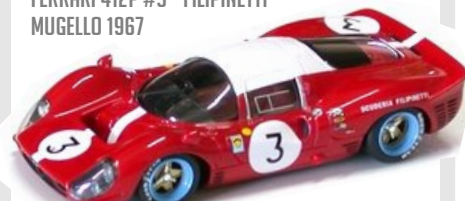
FERRARI 412P #3 - FILIPINETTI MUGELLO 1967