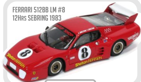
FERRARI 512BB LM #8 12Hrs SEBRING 1983