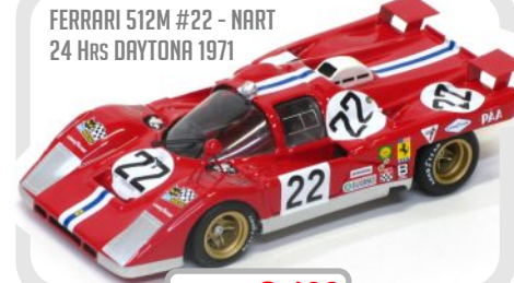
FERRARI 512M #22 - NART 24 Hrs DAYTONA 1971