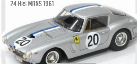
FERRARI 250 SWB #20 - NART 24 Hrs MANS 1961