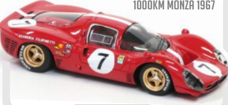
FERRARI 412P #7 FILIPINETTI 1000KM MONZA 1967