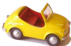
FIAT 500 "CORTA"