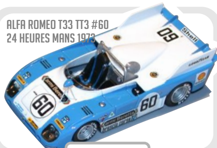
ALFA ROMEO T33 TT3 #60 24 HEURES MANS 1973