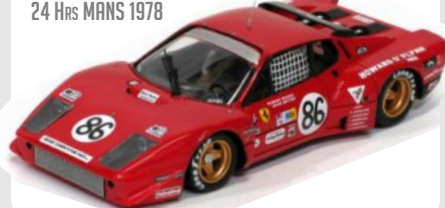
FERRARI 365GT4 BB #86 - GRAND COMPETITION CARS 24 Hrs MANS 1978