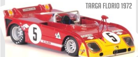
ALFA ROMEO 33TT3 #5 TARGA FLORIO 1972