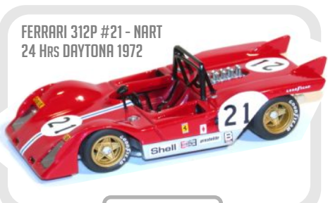
FERRARI 312P #21 - NART 24 Hrs DAYTONA 1972