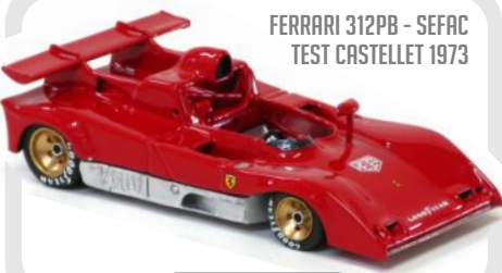
FERRARI 312PB - SEFAC TEST CASTELLET 1973