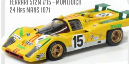
FERRARI 512M #15 - MONTJUICH 24 Hrs MANS 1971