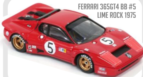
FERRARI 365GT4 BB #5 LIME ROCK 1975