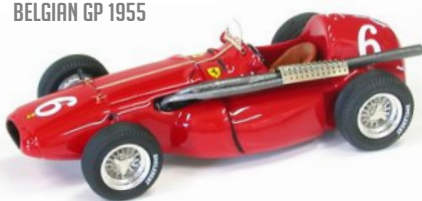
FERRARI 555 #6 - SEFAC BELGIAN GP 1955