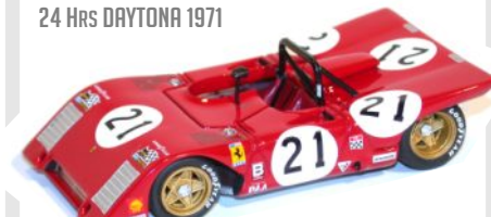
FERRARI 312P #21 - NART 24 Hrs DAYTONA 1971