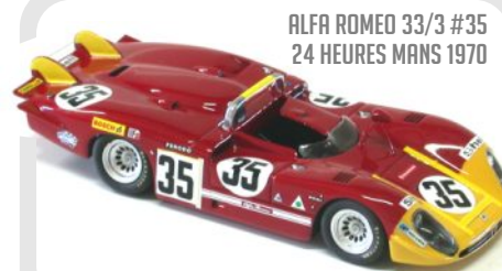
ALFA ROMEO 33/3 #35 24 HEURES MANS 1970