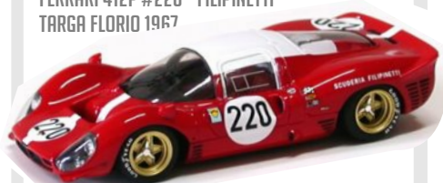
FERRARI 412P #220 - FILIPINETTI TARGA FLORIO 1967