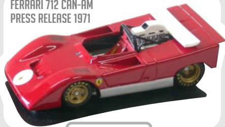
FERRARI 712 CAN-AM PRESS RELEASE 1971