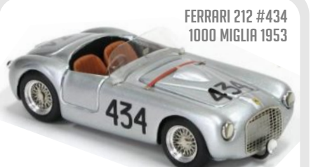
FERRARI 212 #434 1000 MIGLIA 1953