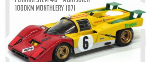
FERRARI 512M #6 - MONTJUCH 1000KM MONTHLERY 1971