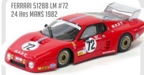
FERRARI 512BB LM #72 24 Hrs MANS 1982