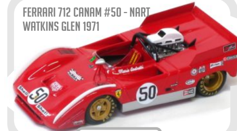
FERRARI 712 CANAM #50 - NART WATKINS GLEN 1971