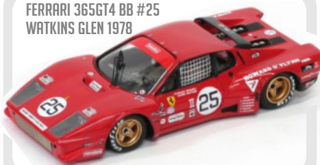
FERRARI 365GT4 BB #25 WATKINS GLEN 1978