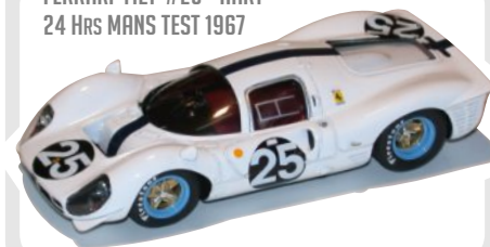
FERRARI 412P #25 - NART 24 Hrs MANS TEST 1967