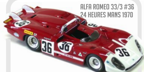
ALFA ROMEO 33/3 #36 24 HEURES MANS 1970