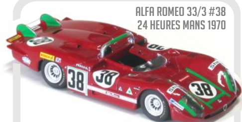
ALFA ROMEO 33/3 #38 24 HEURES MANS 1970