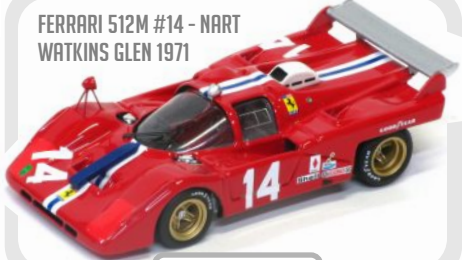
FERRARI 512M #14 - NART WATKINS GLEN 1971