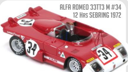
ALFA ROMEO 33TT3 M #34 12 Hrs SEBRING 1972