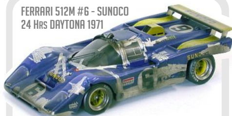
FERRARI 512M #6 - SUNOCO 24 Hrs DAYTONA 1971