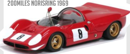
FERRARI 412P SPYDER #8 200MILES NORISRING 1969