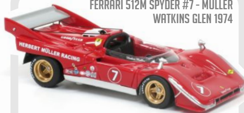
FERRARI 512M SPYDER #7 - MULLER WATKINS GLEN 1974