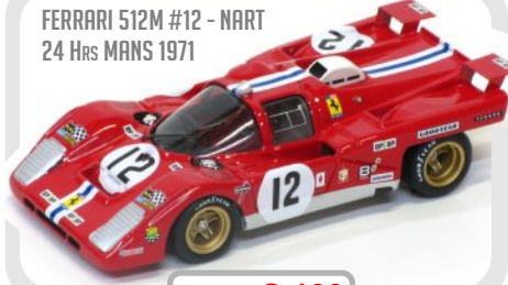
FERRARI 512M #12 - NART 24 Hrs MANS 1971