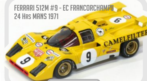
FERRARI 512M #9 - EC FRANCOCHAMPS 24 Hrs MANS 1971