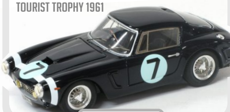
FERRARI 250 SWB #7 TOURIST TROPHY 1961