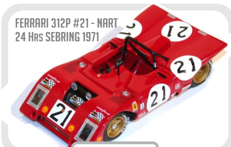
FERRARI 312P #21 - NART 24 Hrs SEBRING 1971