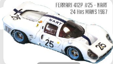
FERRARI 412P #25 - NART 24 Hrs MANS 1967