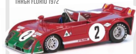
ALFA ROMEO 33TT3 #2 TARGA FLORIO 1972