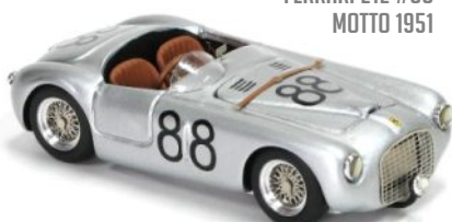
FERRARI 212 #88 MOTTO 1951