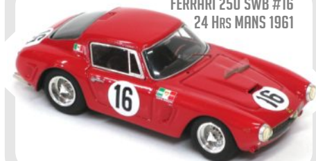
FERRARI 250 SWB #16 24 Hrs MANS 1961