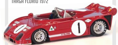
ALFA ROMEO 33TT3 #1 TARGA FLORIO 1972