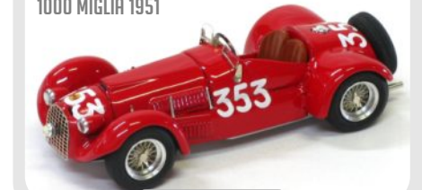
FERRARI 166 SEMIAERODINAMICA #353 1000 MIGLIA 1951