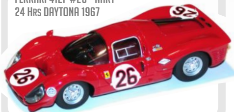
FERRARI 412P #26 - NART 24 Hrs DAYTONA 1967