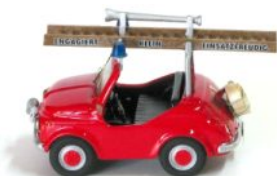
FIAT 500 CORTA FIRE BRIGADE SERVICE