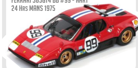
FERRARI 365GT4 BB #99 - NART 24 Hrs MANS 1975