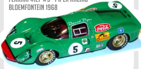
FERRARI 412P #5 - PIPER RACING BLOEMFONTEIN 1968