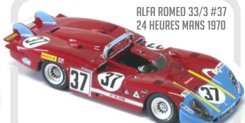
ALFA ROMEO 33/3 #37 24 HEURES MANS 1970