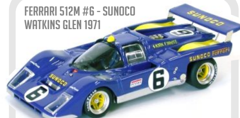
FERRARI 512M #6 - SUNOCO WATKINS GLEN 1971