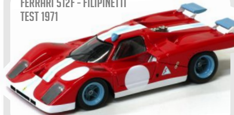
FERRARI 512F - FILIPINETTI TEST 1971