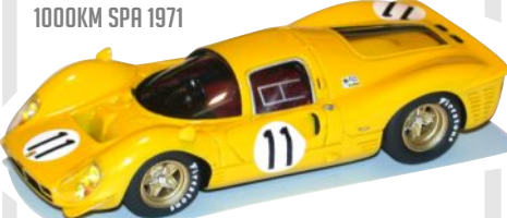
FERRARI 412P #11 - EC.FRANCORCHAMPS 1000KM SPA 1971