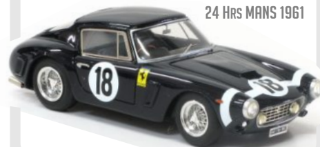
FERRARI 250 SWB #18 24 Hrs MANS 1961