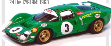
FERRARI 412P #3 - PIPER RACING 24 Hrs KYALAMI 1968