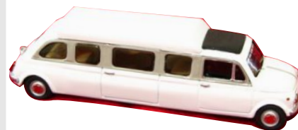
FIAT 500 LIMOUSINE