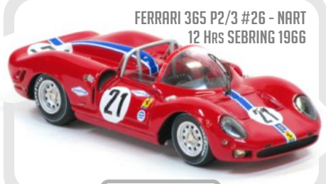
FERRARI 365 P2/3 #26 - NART 12 Hrs SEBRING 1966