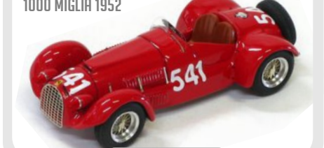
FERRARI 166 SEMIAERODINAMICA #541 1000 MIGLIA 1952