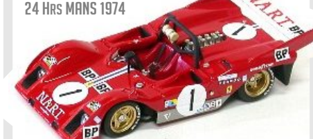
FERRARI 312P #1 - NART 24 Hrs MANS 1974