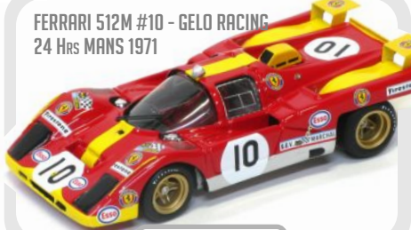
FERRARI 512M #10 - GELO RACING 24 Hrs MANS 1971