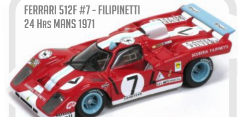
FERRARI 512F #7 - FILIPINETTI 24 Hrs MANS 1971