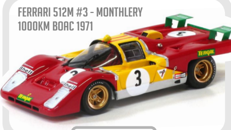
FERRARI 512M #3 - MONTHLERY 1000KM BOAC 1971