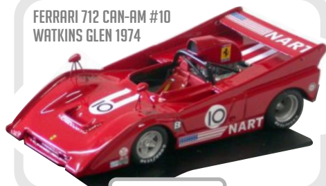
FERRARI 712 CAN-AM #10 WATKINS GLEN 1974