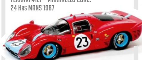
FERRARI 412P - MARANELLO CONC. 24 Hrs MANS 1967