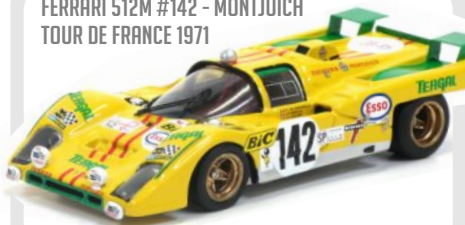
FERRARI 512M #142 - MONTJUICH TOUR DE FRANCE 1971