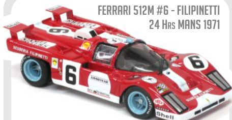
FERRARI 512M #6 - FILIPINETTI 24 Hrs MANS 1971