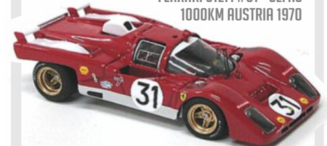
FERRARI 512M #31 - SEFAC 1000KM AUSTRIA 1970