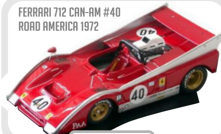
FERRARI 712 CAN-AM #40 ROAD AMERICA 1972