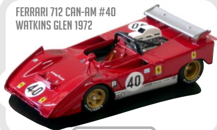
FERRARI 712 CAN-AM #40 WATKINS GLEN 1972