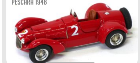
FERRARI 166 SEMIAERODINAMICA #2 PESCARA 1948