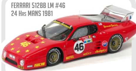
FERRARI 512BB LM #46 24 Hrs MANS 1981