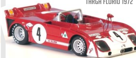
ALFA ROMEO 33TT3 #4 TARGA FLORIO 1972