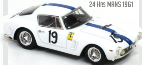
FERRARI 250 SWB #19 - NART 24 Hrs MANS 1961