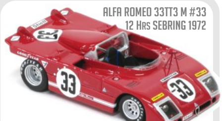
ALFA ROMEO 33TT3 M #33 12 Hrs SEBRING 1972