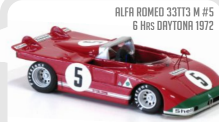
ALFA ROMEO 33TT3 M #5 6 Hrs DAYTONA 1972