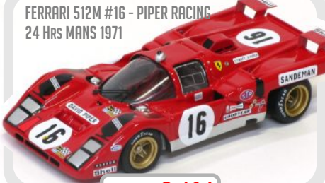
FERRARI 512M #16 - PIPER RACING 24 Hrs MANS 1971