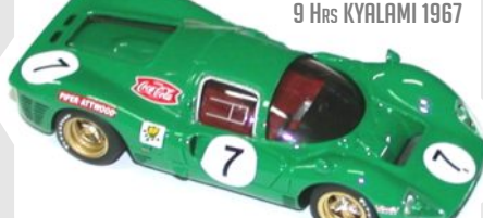
FERRARI 412P #7 - PIPER RACING 9 Hrs KYALAMI 1967