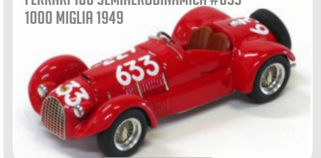
FERRARI 166 SEMIAERODINAMICA #633 1000 MIGLIA 1949