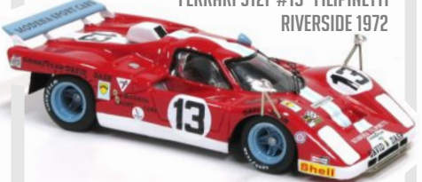
FERRARI 512F #13- FILIPINETTI RIVERSIDE 1972