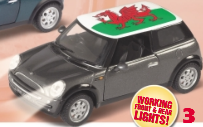
BMW Mini Cooper S (Welsh Dragon) - Silver ♂ Ref: CC86524 £19.99 Scale 1:36 Approx. length 90mm