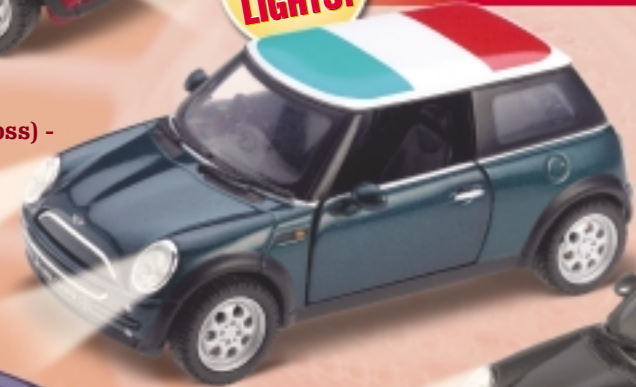
♂ BMW Mini Cooper S (Irish Tricolour) - British Racing Green Ref: CC86525 £19.99 Scale 1:36 Approx. length 90mm