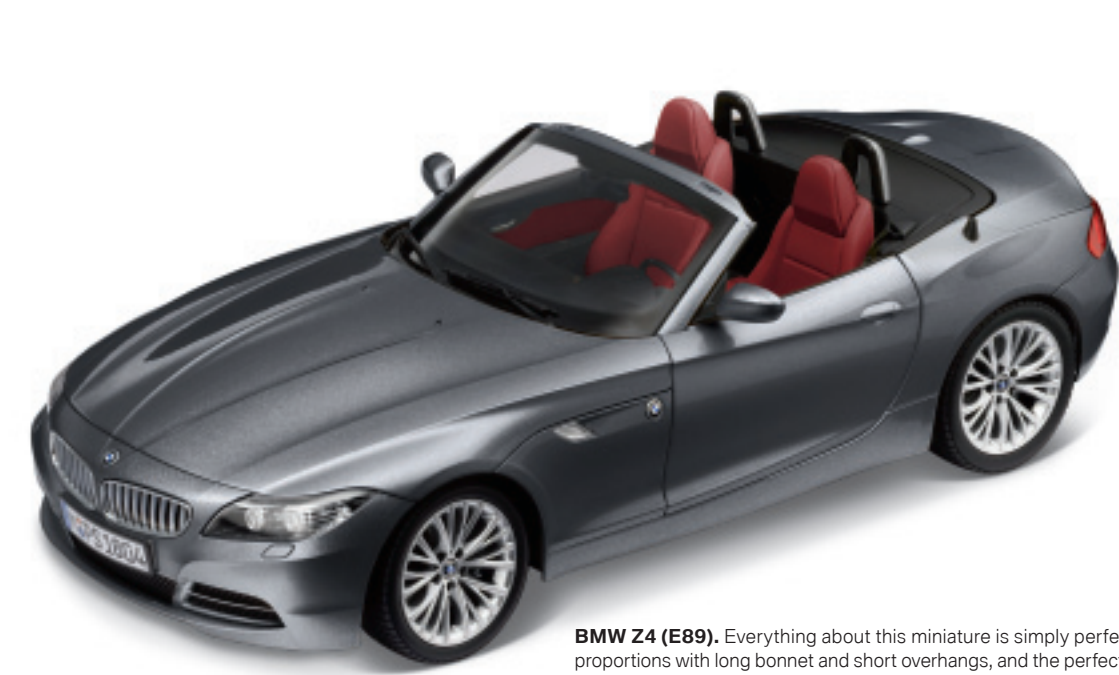
BMW Z4 (E89). Everything about this miniature is simply perfect: the classic proportions with long bonnet and short overhangs, and the perfect interplay of eye-catching linear design and smooth transitions. Depending on the scale of the model, the Z4 bonnet can be opened to reveal the engine while also has a folding hardtop (shown on the title page) just like the original BMW Z4.

Scale: 1:87 Space Grey 80 41 2 147 091 Orion Silver 80 41 2 147 090 Deep Sea Blue 80 41 2 147 089