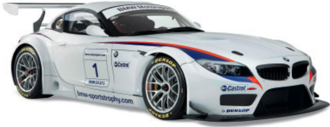
BMW Z4 GT3. The BMW Z4 GT3 is the latest product from the BMW Motorsport stable. Even the standard model of the BMW Z4 cannot fail to impress: with its extended bonnet, long wheel base and short overhangs, the sports car not only has an unmistakable appearance, it is also the ideal starting point for a racing car. While the large BMW Z4 GT3 is equipped for championship competitions according to the GT3 rules and for 24-hour long-distance races, the miniature version brings the world of racing into a domestic setting. (Image may vary from the original)

Scale: 1:18 Space Grey 80 43 2 147 085 Orion Silver 80 43 2 147 084 Deep Sea Blue 80 43 2 147 083