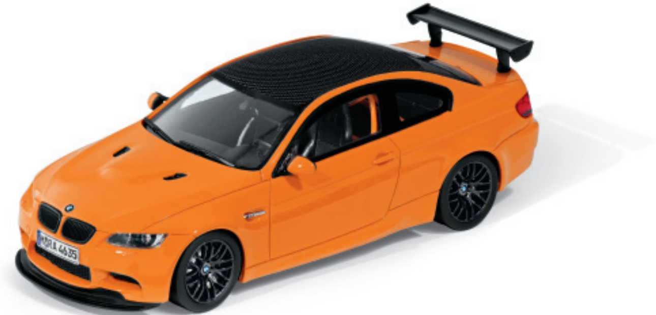
BMW M3 GTS. The BMW M3 GTS is the enhanced version of the BMW M3. Originally intended for club sport events, but also approved for normal road use, this car exudes a pure sporting nature, even in miniature. The Fire Orange paint work and the rear spoiler are the perfect complement to the 450 bhp under the bonnet. This superior car can go from 0 to 100 in just 4.4 seconds, reaching a maximum speed of up to 305 km/h.

Scale: 1:43 (Available from 05/2011) White 80 42 2 209 950