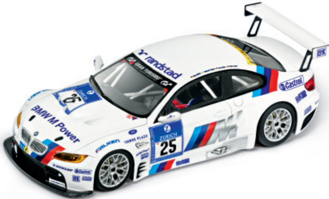
BMW M3 GT2 Starting number 25. The BMW M3 GT2, normally found in long-distance races and classic GT events, brings a taste of the racing world to your home. The racing version of the BMW M3 standard model impresses with its superior dynamism, something it managed to prove by winning the 24-hour race at the Nürburgring track. This miniature is an exact replica of the original, right down to the roll bars, sports seats and rear spoiler.