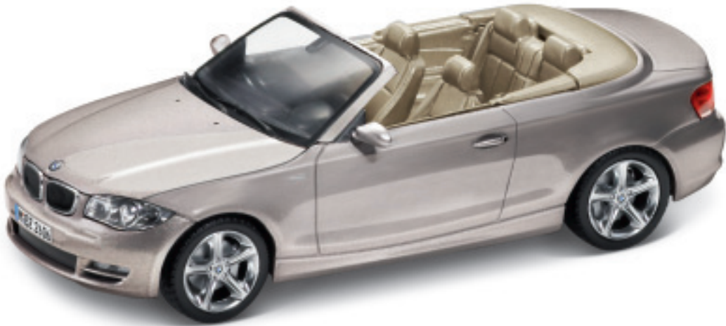
BMW 1 Series Convertible (E88). The level of detail of this 1:18 scale BMW 1 Series Convertible leaves nothing to be desired. The miniature features the elegant tailgate and elongated bonnet that people have come to know and love on the original vehicle. The brake system and engine compartment are faithfully modelled on the original. The doors, boot lid and bonnet can be opened, permitting an interior view that will warm the heart of any BMW enthusiast.

Scale: 1:64 (Available from 04/2011) White/Blue 80 45 2 209 951