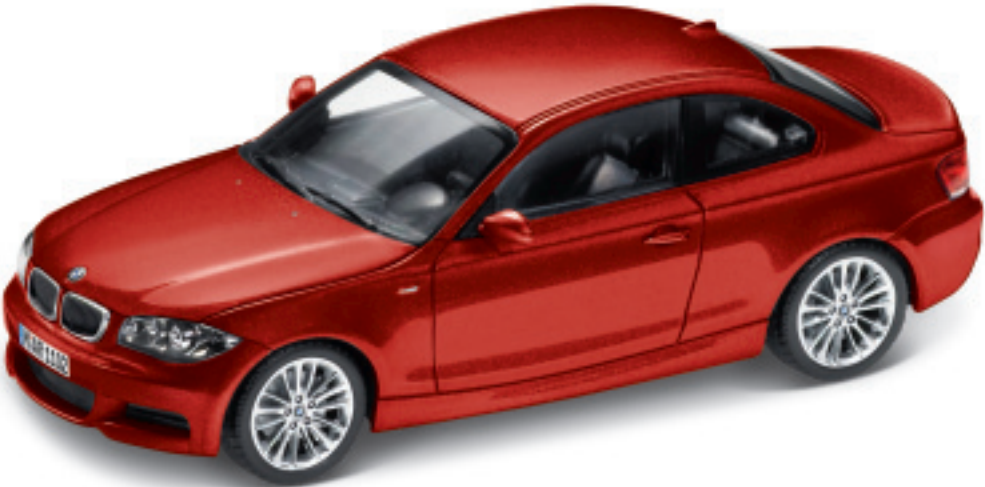
BMW 1 Series Coupé (E82). This miniature is a real eye-catcher - and not just because of its colour. The elongated bonnet, trapezoidal roof shape and crisply formed tailgate demonstrate just how perfect proportions can be. The original wheel rims with BMW logo are an inspired touch. The interior of the 1:18 scale model of the BMW 1 Series Coupé also promises plenty of enjoyment. Leather seats and genuine carpeting make it feel like you are looking at the original.

Scale: 1:87 Cashmere Silver 80 41 0 427 039 Sparkling Graphite 80 41 0 427 041 Titanium Silver 80 41 0 427 040 Scale: 1:18 Cashmere Silver 80 43 0 427 020 Sparkling Graphite 80 43 0 427 022 Titanium Silver 80 43 0 427 021