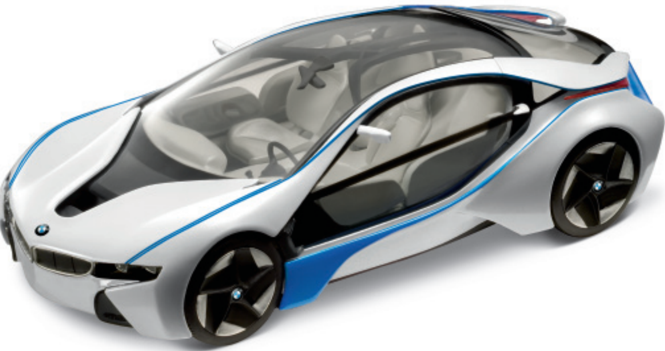
BMW Vision EfficientDynamics. The BMW Vision EfficientDynamics concept car will not just impress car experts. Even in its miniature form the concept for the forward-looking diesel-hybrid is sure to please . (Image may vary from the original)

Scale: 1:64 (Available from 04/2011) White/Blue 80 45 2 209 951